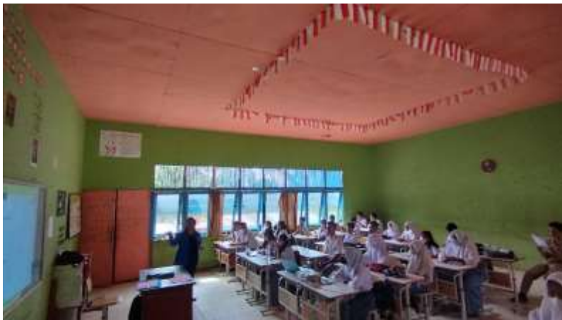
P.2 The students follow and listen to the researcher the class verywell