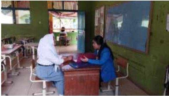
P.5 The researcher doing an interview