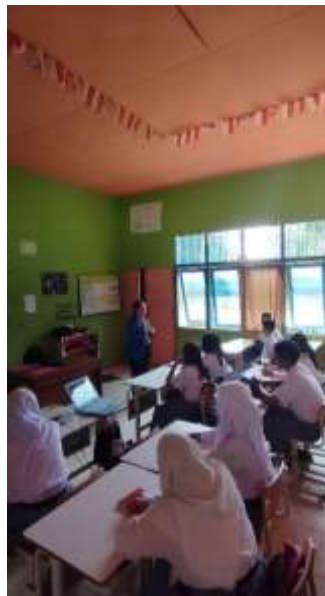
P.3 Researcher gives the instruction about the talking stick method