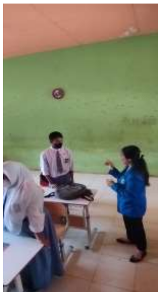
P.4 The Students follow the talking stick method