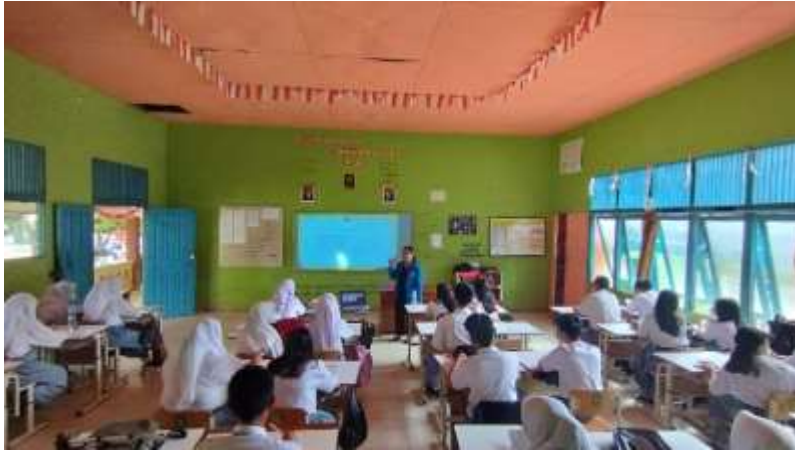
P.1 The researcher teach the students