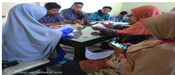
Figure 2. FGD on Edu finance Management, BOS Management in Private Senior High Schools in the city of Singkawang