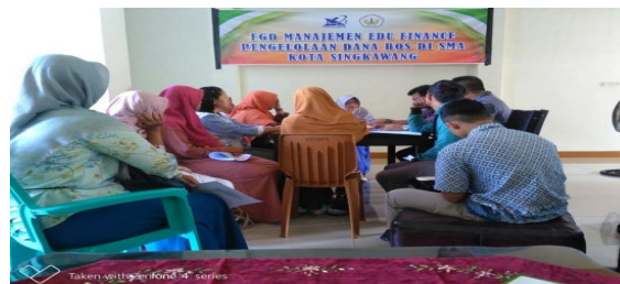
Figure 1. FGD on Edu-finance Management, BOS Management in Public Senior High Schools in Singkawang City Source: Processed Primary Data (2019)

tain education financing from various sources of income as well as an annual work program consisting of a number of routine activities and several other activities accompanied by detailed financing plans in one fiscal year.