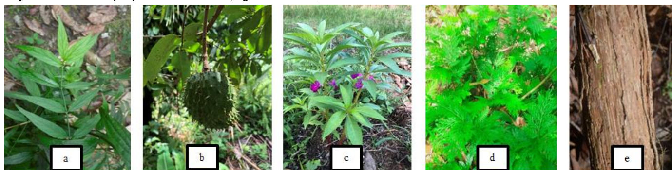
Figure 2a-e: (a). Clinacanthus nutans Lindau; (b). Annona muricata L; (c). Impatiens balsamina L; (d). Selaginella doederleinii Hieron; (e) Spatholobus littoralis Hassk.

lung cancer) and tumors are presented in Figure 2a-e.